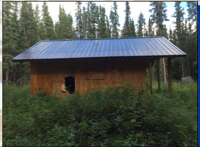
Do it yourself bear door