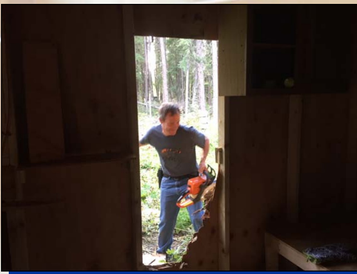
Patching up the wall

the cabin, all of the other cabins that I have seen broken into had lots of scat inside which made the cleanup no fun.