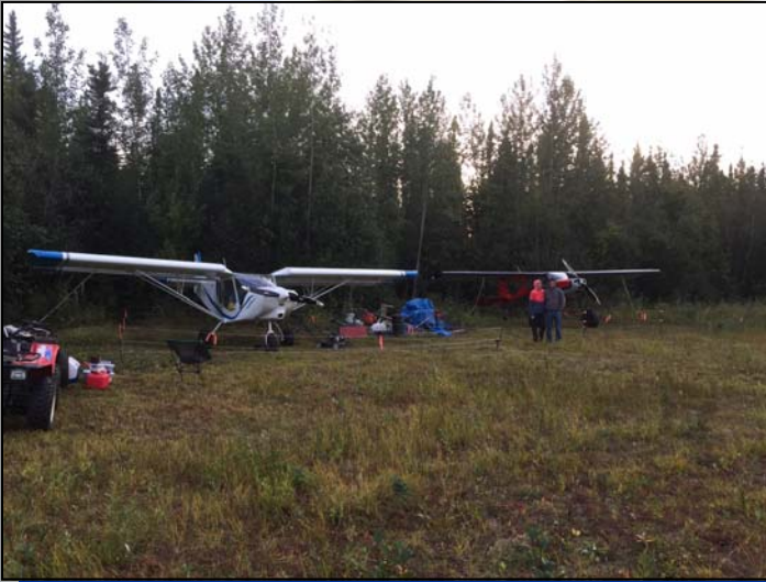
Aircraft bear fences in place...