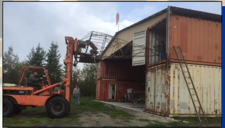
Fuselages loaded into upper connexes for safe keeping during upcoming hangar work.