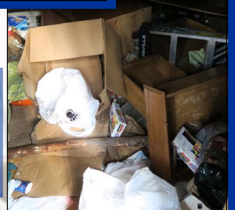
Not quite how we left it... Bear interior decorating